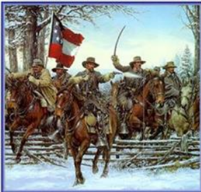
Painting from 1st Louisiana Cavalry Reg. Facebook site ,