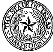
EXHIBIT A: ELECTION DATE AND TIMES